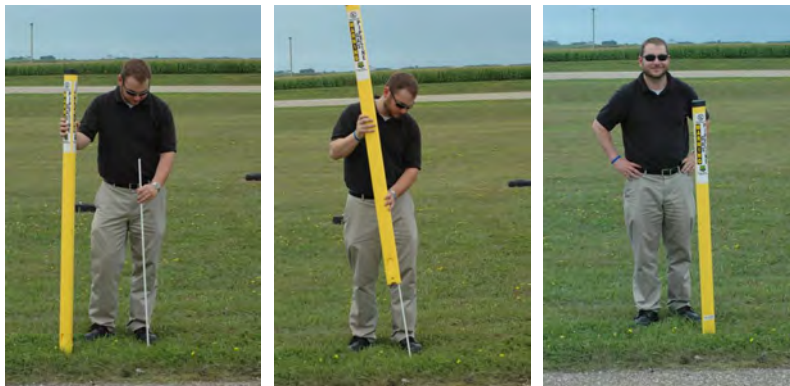
1. Insert Flex-PLUS rod in hole/anchor

The TriView PLUS can be installed via direct bury, or with a soil anchor.